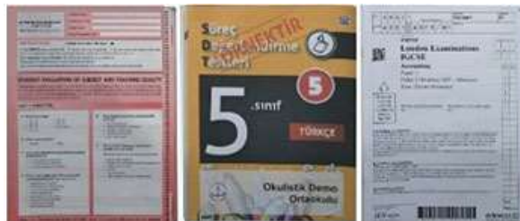
Examples of examination papers made by IBIS Smart-binders at different customer sites around the world

For this reason the Smart-binder has a fully integrated sheet detection and tracking system (using a bar code printed on each sheet) to ensure the integrity of each finished booklet. If there is any risk that a booklet could have incorrect pages, or the correct pages in the wrong sequence, then it is automatically rejected.