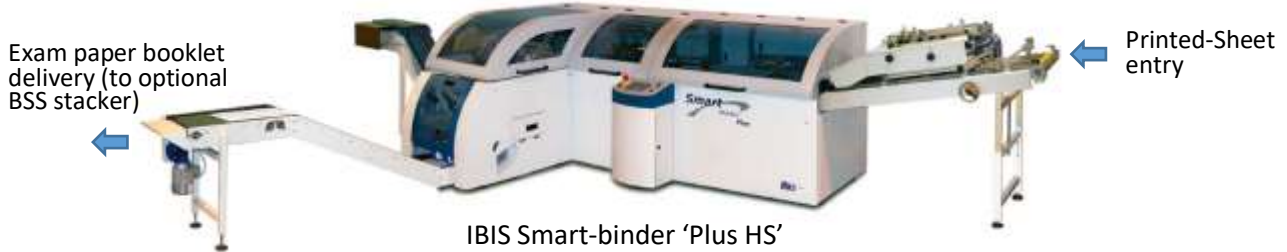
IBIS Smart-binder 'Plus HS'

IBIS's unique and patented ISG cold glue system provides a higher quality binding alternative to wire stitching. This results in improved booklet lay-flat which can help subsequent inserting and mailing operations.