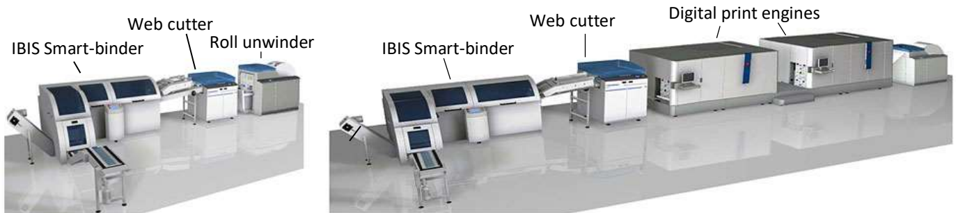
Near-line, fed from a web-cutter